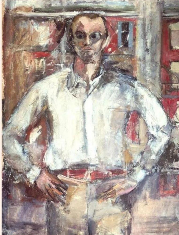
'Portrait of Frank O'Hara' (1953) by Larry Rivers

Hanging opposite Ada is Larry Rivers' "Portrait of Frank O'Hara" (1953). The poet was a friend and a lover but also a long-term collaborator. Rivers, who is known for working at the crossroads of Abstract Expressionism and Pop Art, portrays O'Hara face on, hands on hips. It's a powerful stance, made more forceful by the fact that O'Hara takes up most of the canvas, and yet the muted tones of the figure blend into the background. The result: a merging of poet and painter.